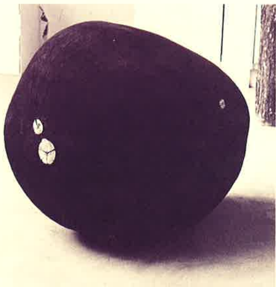
Antony Gormley: End Product , 1979

Antony Gormley was born in 1950. He studied anthropology, archaeology and art at Cambridge and started making sculpture after travelling widely in India and the Near East. This is his first one-man exhibition since leaving the Slade School of Art in 1979.