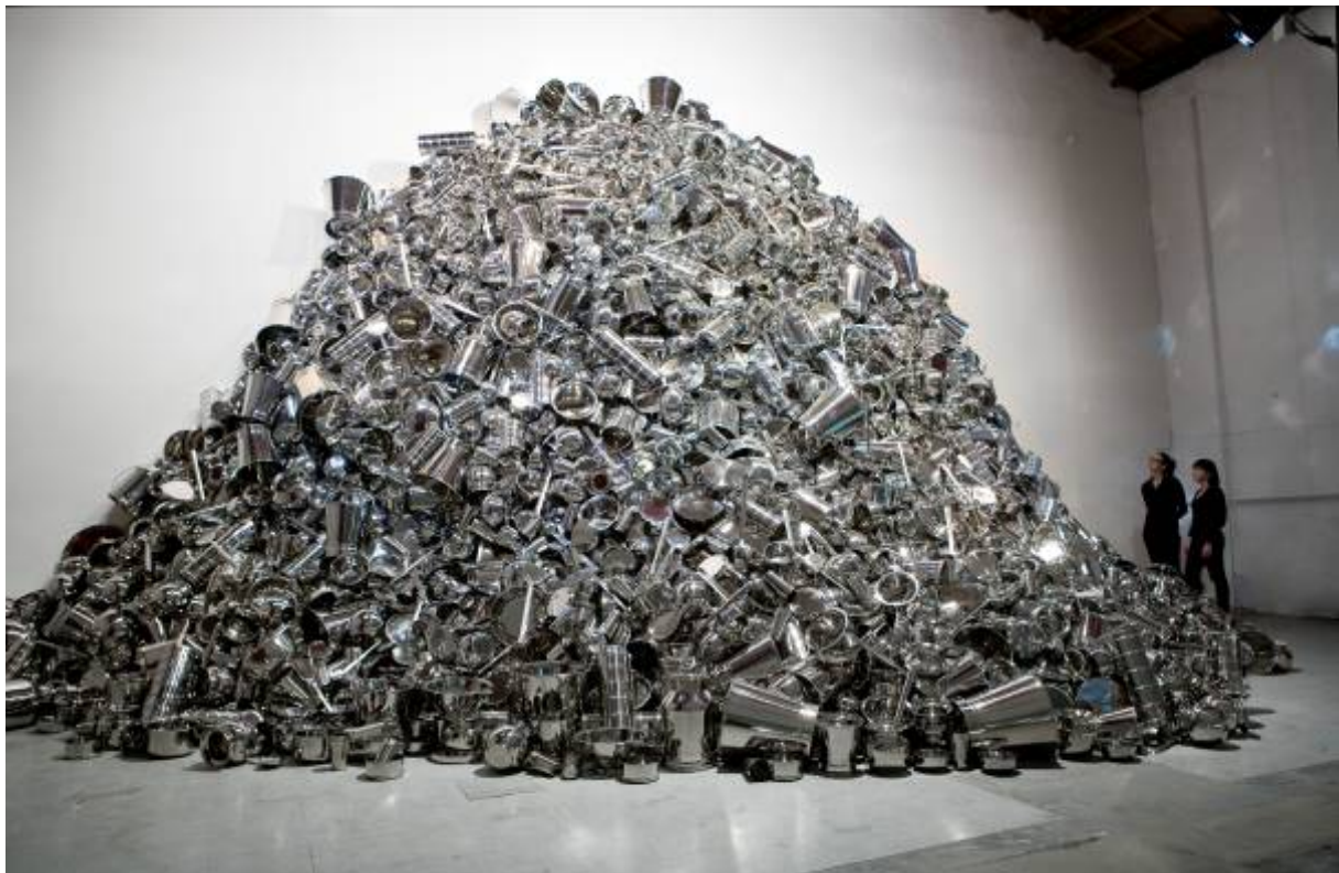
Subodh GUPTA 5 Offerings for the Greedy Gods, 2006-2008 stainless steel utensils 450 x 1100 x 400 cm