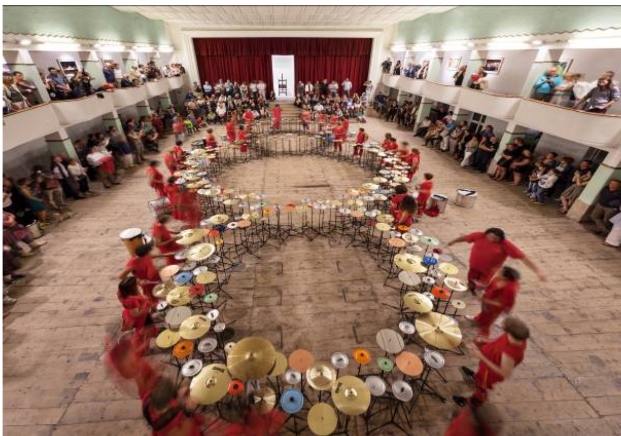
Michelangelo PISTOLETTO The Third Paradise, 2003-2015 346 cymbals, lids 120 x 640 x 1120 cm (approx) Courtesy: GALLERIA CONTINUA, San Gimignano / Beijing / Les Moulins / Habana