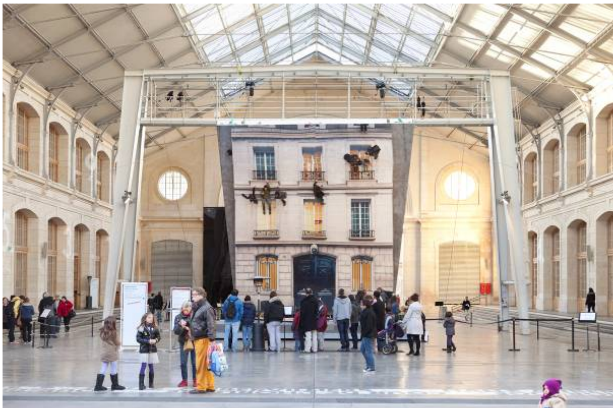
Leandro Erlich Bâtiment , 2004

At CENTQUATRE-PARIS, in the context of the exhibition In-Perception