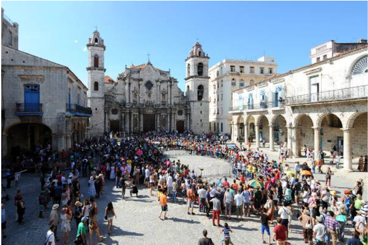
Michelangelo Pistoletto The Third Paradise 2003-2015

346 cymbals, lids 120 x 640 x 1120 cm (approx)