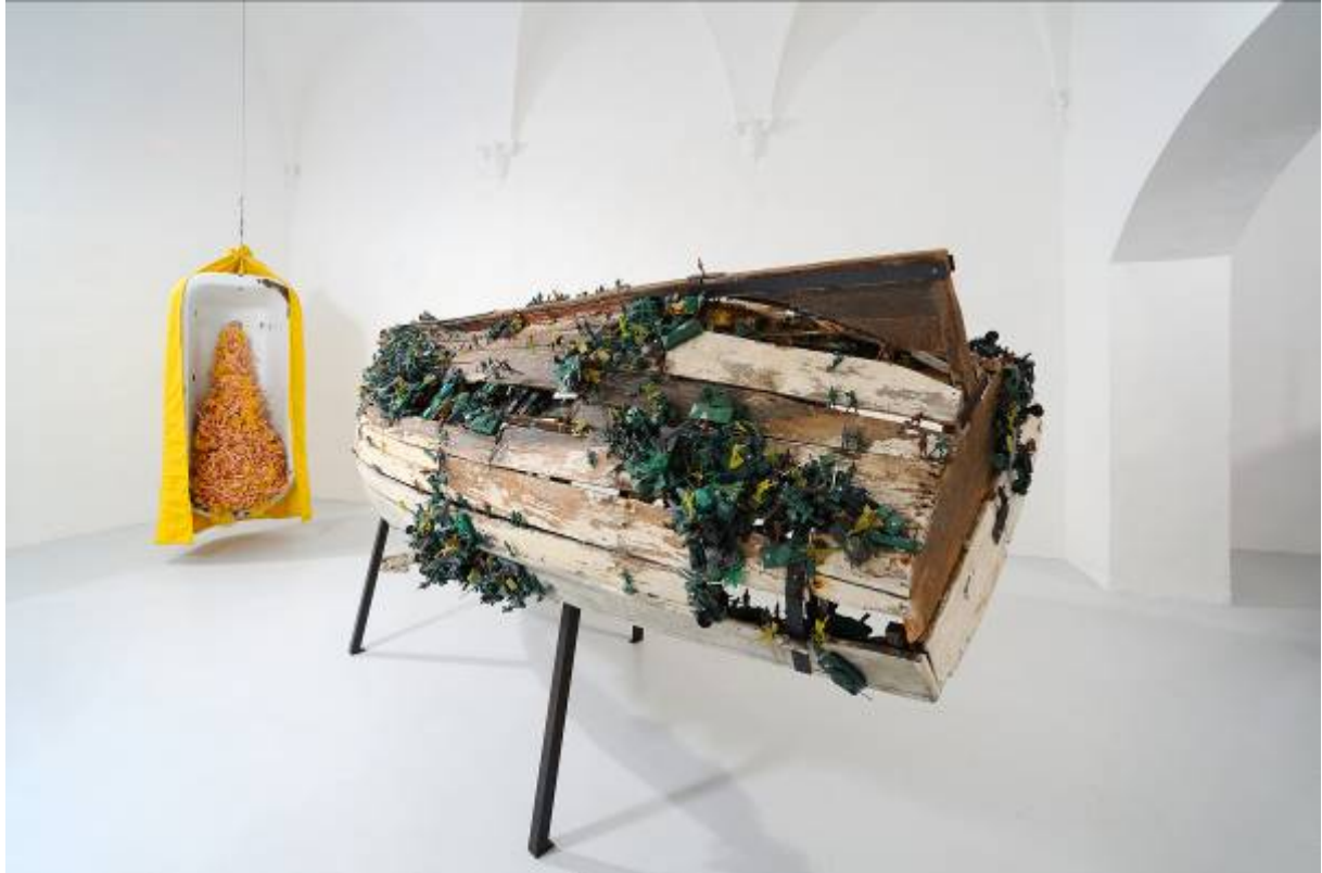
CHEN Zhen Six Roots Enfance / Childhood , 2000 bathtub, barbie, fabric, boat, toy soldiers, metal bathtub: 215 x 55 x 80 cm about; boat: 173 x 382 x 150 cm Courtesy: GALLERIA CONTINUA, San Gimignano / Beijing / Les Moulins / Habana Photo : Michele Alberto Sereni