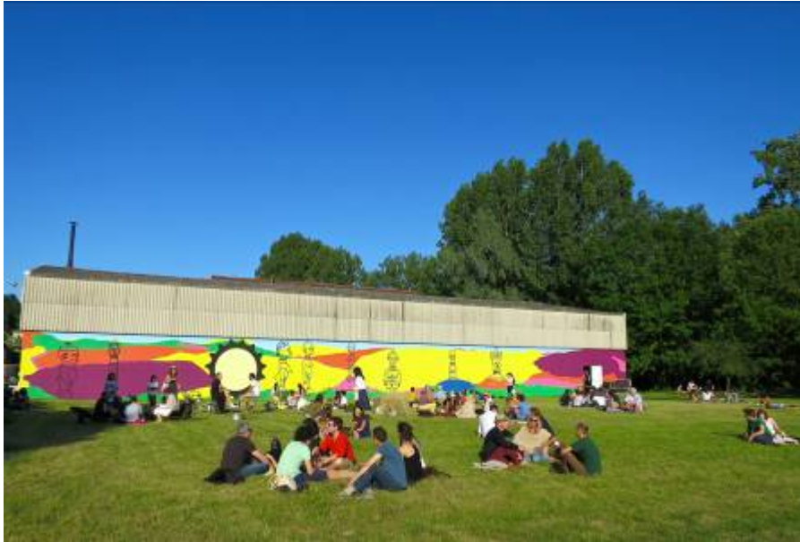
View of a wall drawing by Pascale Marthine Tayou, 4 seasons , 2012

In 2007, GALLERIA CONTINUA , inaugurated les Moulins, an old paper-mill of 10,000 m2 situated in Seine-et-Marne, located in the Parisian countryside.