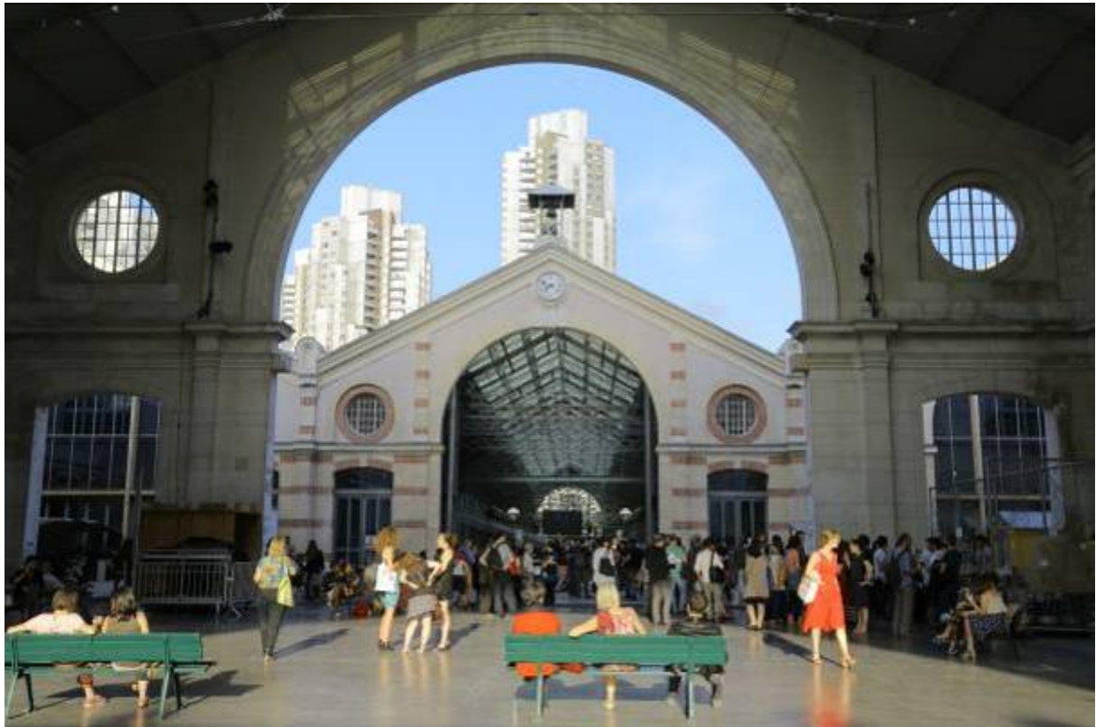
CENTQUATRE-PARIS