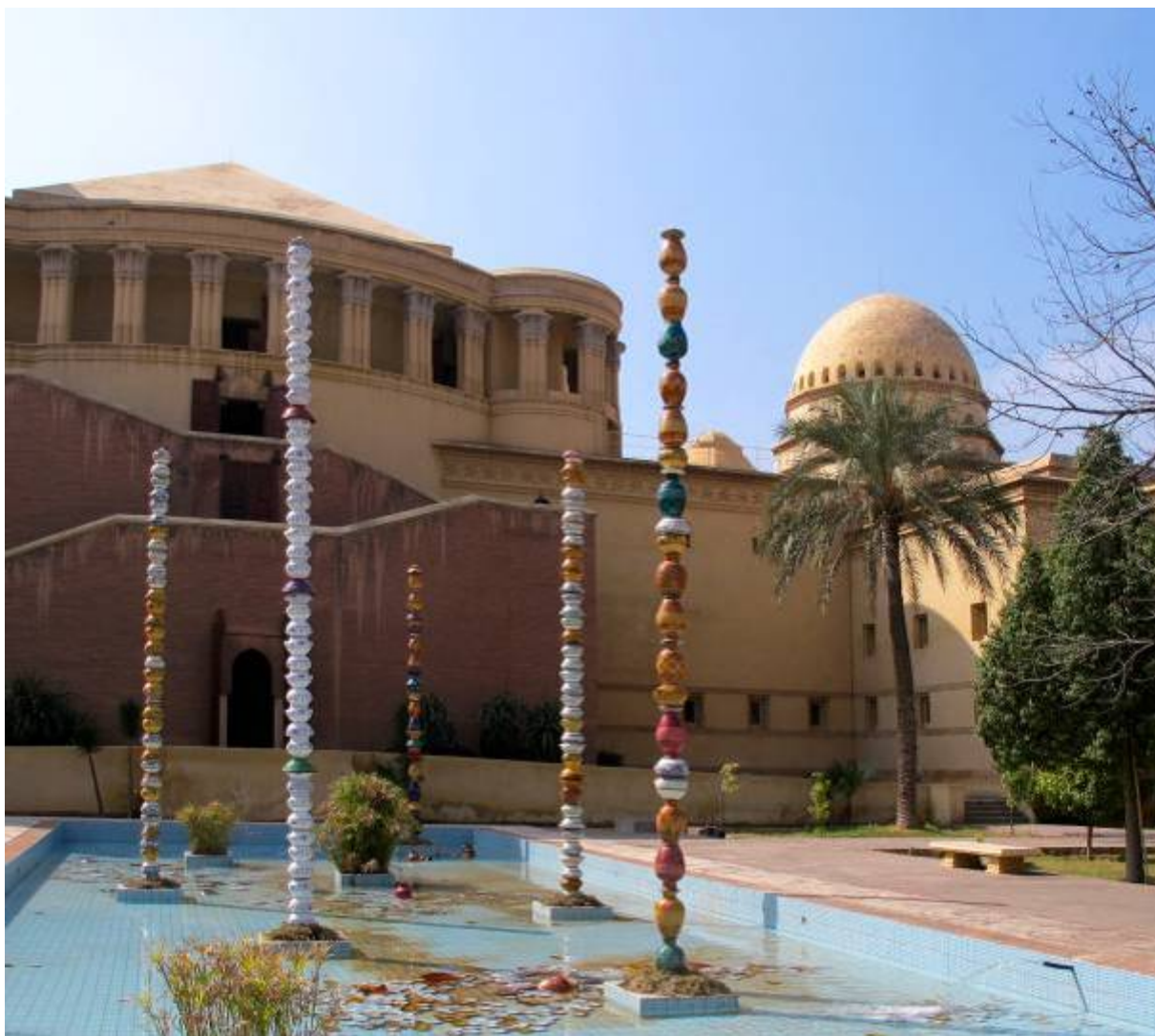
Pascale Marthine TAYOU Colonne Pascale , 2012 arabic pots variable dimensions Installation view of the Marrakech Biennial 2012