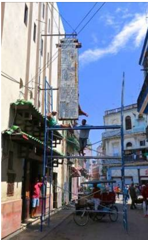
GALLERIA CONTINUA / Habana Entrance to the gallery in the Chinese district of Havana. Work in progress

Finally in 2015, it opened a space in Havana, within an old cinema. A new door opens... The priority given to "continuity", is what brings meaning to GALLERIA CONTINUA .