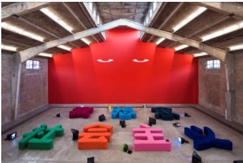
GALLERIA CONTINUA / Beijing View of exhibition by Nedko Solakov, 2010

In 2004, it launched the opening of a gallery in China, becoming the first in that country to offer an international program.