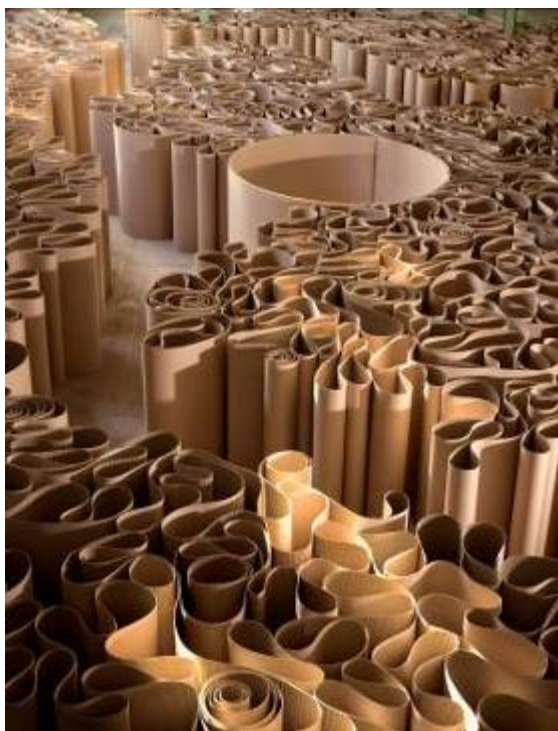
Michelangelo Pistoletto Labyrinthe , 1967 At CENTQUATRE-PARIS GALLERIA CONTINUA, San Gimignano / Beijing / Les Moulins / Habana Photo : Bertrand Huet

At CENTQUATRE-PARIS, in the context of the exhibition In-Perception Courtesy GALLERIA CONTINUA, San Gimignano / Beijing / Les Moulins / Habana Photo : PHP