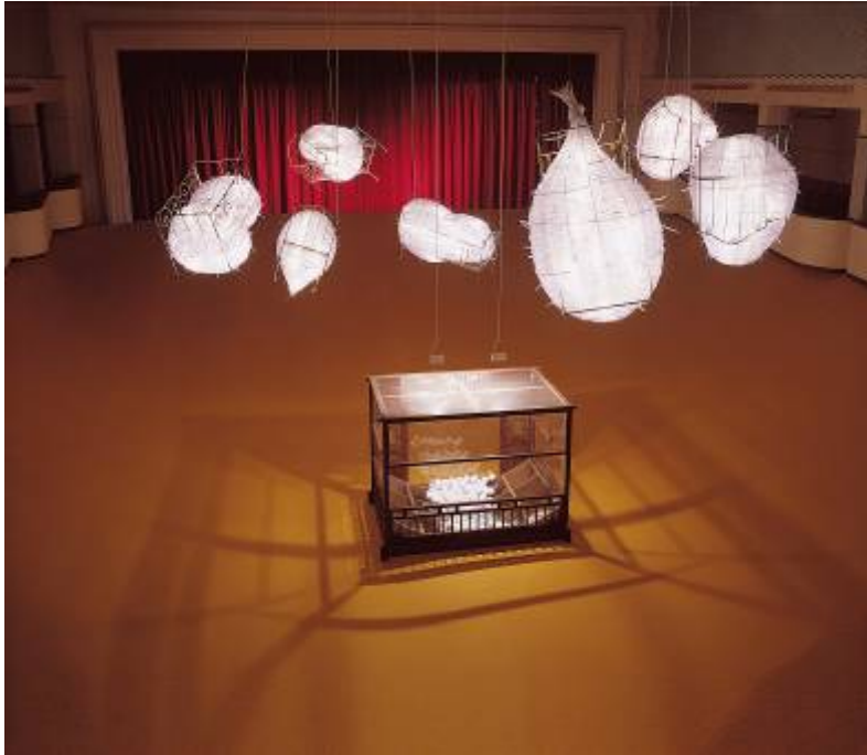
GALLERIA CONTINUA / San Gimignano View of exhibition by Chen Zhen, Field of Synergy , 2000

GALLERIA CONTINUA was founded in 1990 by three friends, Mario Cristiani, Lorenzo Fiaschi, and Maurizio Rigillo, in San Gimignano, a small Italian town of 7 000 inhabitants. The gallery, situated in an old theatre later converted to a cinema, found success very far from the known strongholds of contemporary art, in a region known for its timeless beauty: Tuscany.