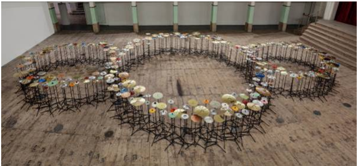
Michelangelo Pistoletto The Third Paradise 2003-2015

Courtesy GALLERIA CONTINUA, San Gimignano / Beijing / Les Moulins / Habana Performance à la Plaza de la Catedral, Biennale de la Havane, Cuba, 2015