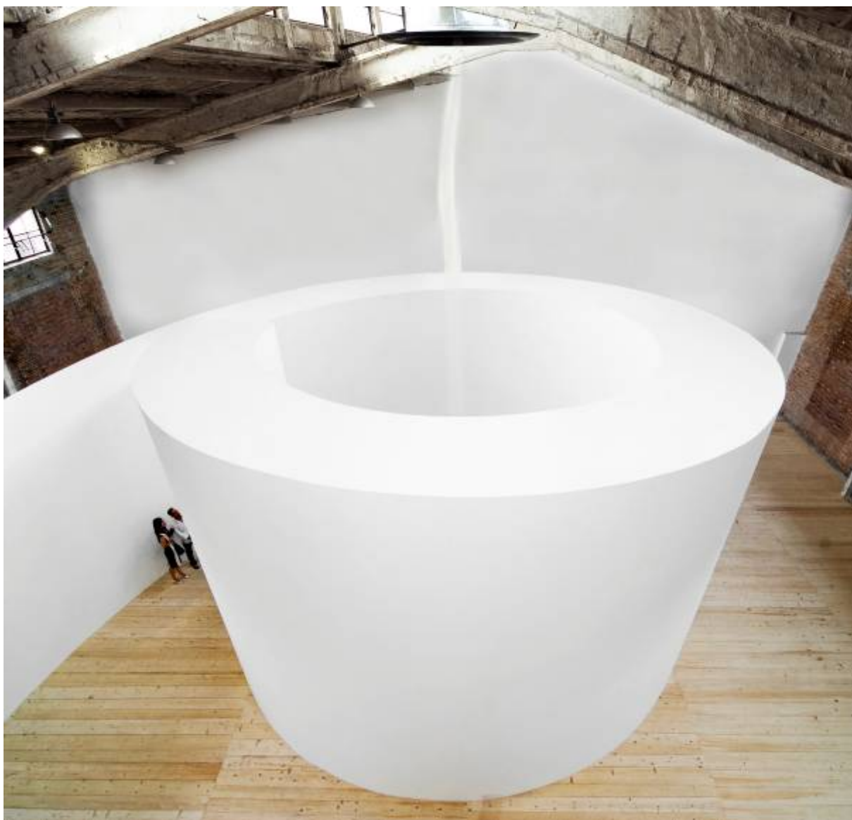
Anish KAPOOR Ascension, 2003-2015 mixed media space dimensions