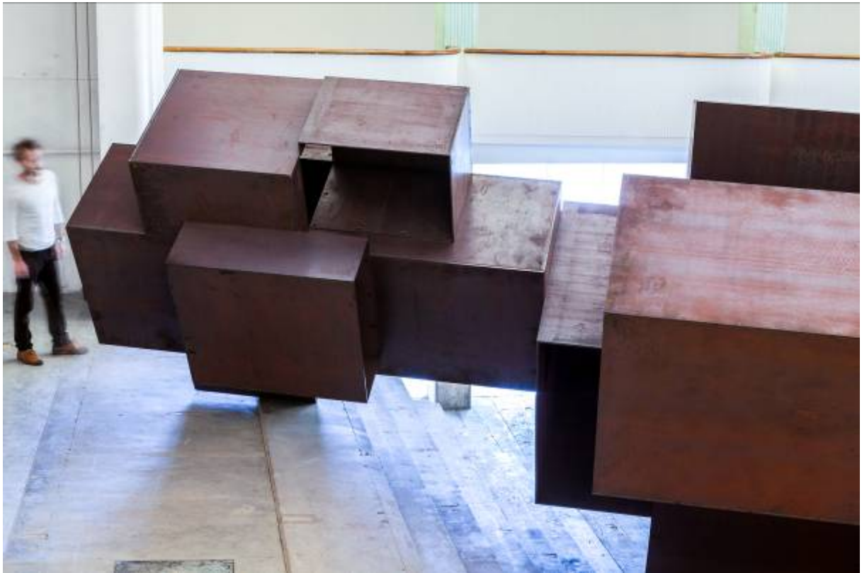
Antony Gormley VESSEL, 2012 Cor-Ten steel, M16 countersunk steel screws 370 x 2200 x 480 cm