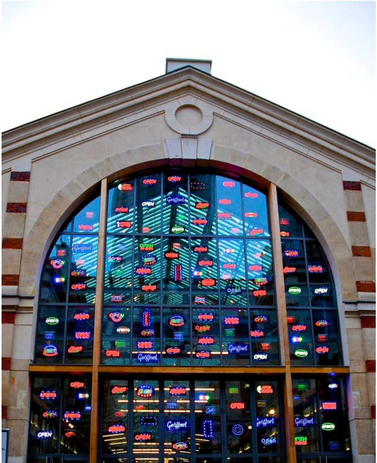
Pascale Marthine Tayou