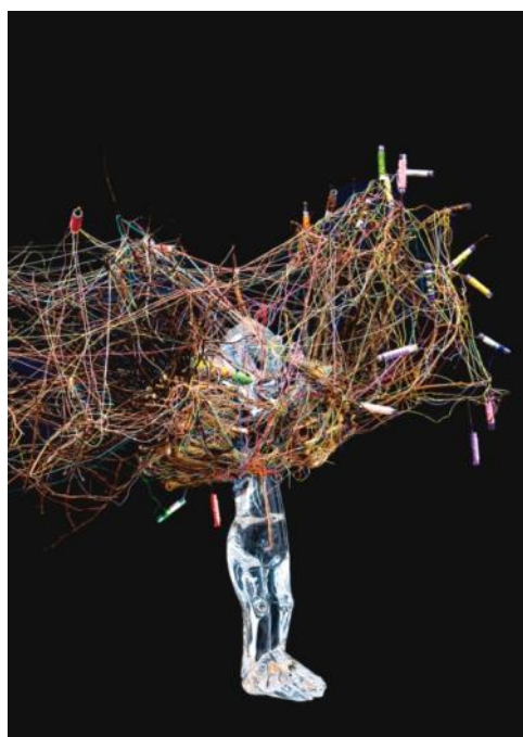
Pascale Marthine Tayou, Poupée Pascale , 2010, crystal, mixed media, 82 x 105 x 66cm

Leaving from La Rotonde (metro station Jaurès), following a circuit along the canal Saint-Martin, to arrive at CENTQUATRE-PARIS. Approximately 50 musicians from the group Bandao , come directly from Tuscany, will play the drums accompanied by local residents.